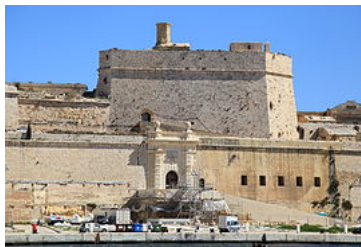
Ferramolino's Cavalier, Fort St. Angelo, Birgu, Malta